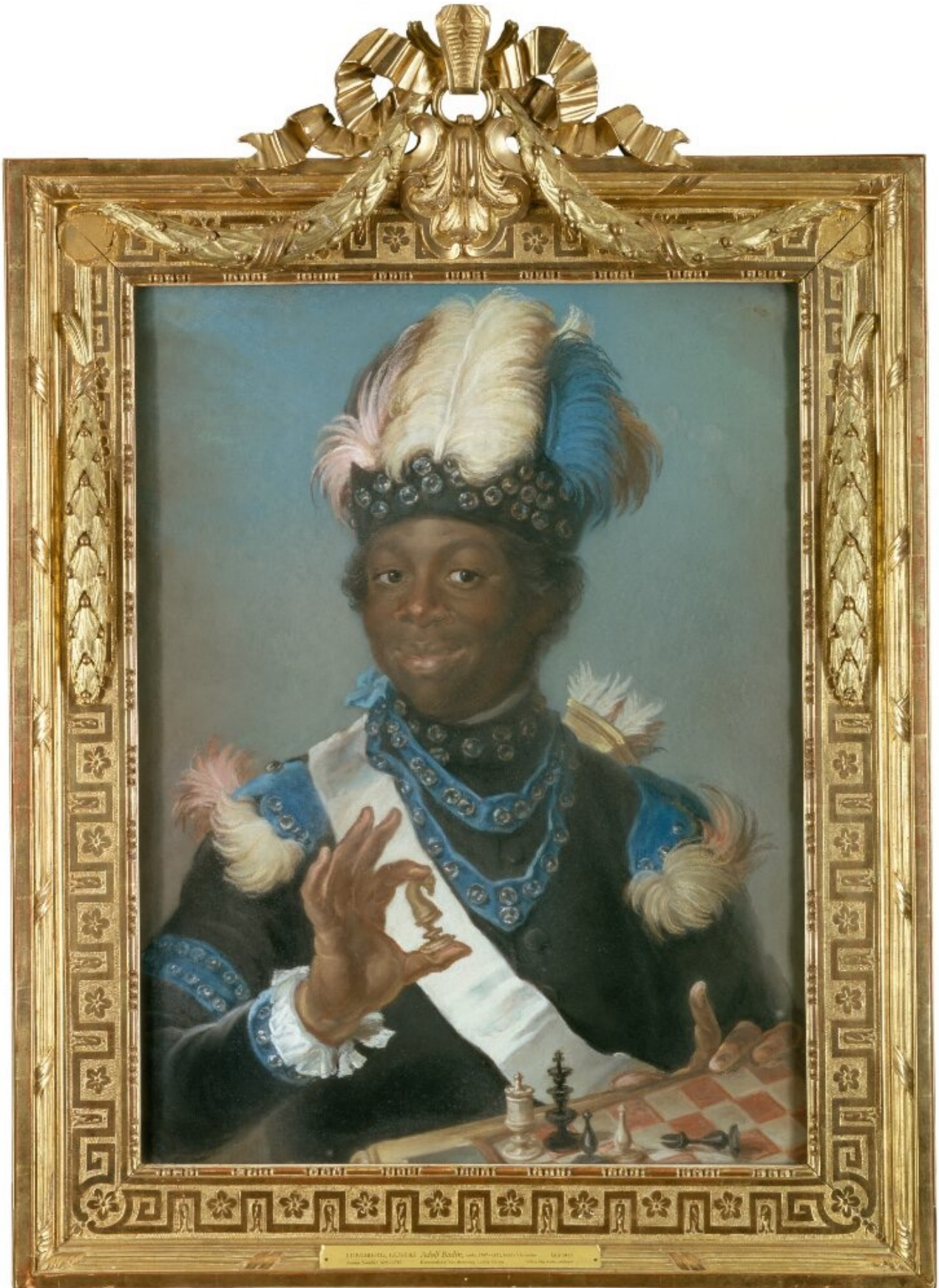
Portrait of a Black man playing chess, 18th century. The man is wearing a dark coat with a white ruffled collar and a blue sash. He is wearing a tall, ornate hat with a large white plume and a blue feather. He is seated at a chessboard, with his hands positioned over the pieces. The chessboard is checkered, and several chess pieces are visible. The portrait is set within a highly decorative gold frame featuring a Greek key border and a large, ornate crest at the top. The background is a plain, light blue-grey color.